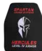
10" x 12" Hercules (Ceramic)