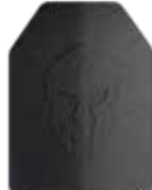
10" x 12" and 9.5" x 12.5" ESAPI Elaphros® Lightweight (Composite)