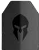
9.5" x 12.5" ESAPI AR550 Steel Single Curve*