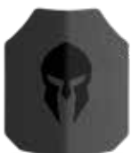
10" x 12" Shooters Cut AR550 Steel Single Curve* Plus all other Spartan Armor steel plates of this size