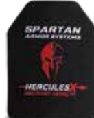
9.5" x 12.5" ESAPI Hercules X (Ceramic)