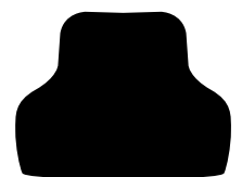
Shape and color of the HG2 - Level IIIA Back Panel *